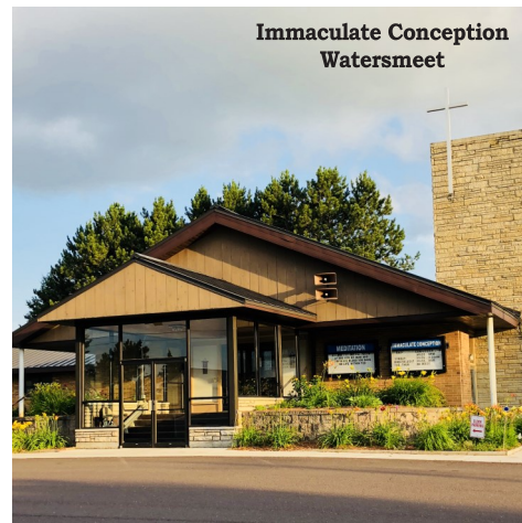
Immaculate Conception Watersmeet