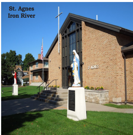
St. Agnes Iron River